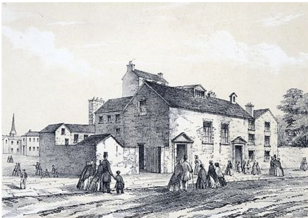
The hymn was first sung on Easter Sunday of 1740 at The Foundry in London.

Charles Wesley, the co-founder of the Methodist movement, wrote "Christ the Lord Is Risen Today" in 1739 where it was initially titled "Hymn for Easter Day." He based it on an older anonymous Bohemian hymn titled "Jesus Christ Is Risen Today". The new hymn was first performed at the first service at The Foundry Meeting House after Wesley had adapted it into the first Methodist chapel. Following this, Wesley published it in the Hymns and Sacred Poems hymnal of 1739, initially with 11 verses of four lines each. The hymn was subsequently published in the hymnal A Collection of Hymns for the Use of the People called Methodists , and in 1754, it appeared in Harmonia Sacra , a hymnal compiled by Thomas Butts. The hymn was later edited by Martin Madan for inclusion in his Psalms and Hymns hymnal (1769) by removing the seventh, eighth and ninth verses. The hymn eventually became popular in the Church of England from around 1780. Charles Wesley's brother, John Wesley excluded it from the Wesleyan Methodist Church's Wesleyan Hymn Book , which John did to preclude the inclusion of any specific seasonal hymns. It was not until 1831, when the Supplement to the Collection was published by an unknown Methodist, that "Christ the Lord is Risen Today" made it into the hymnals of the Methodist Church regularly. Prior to this hymn being published, church music had